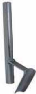
TM-TB Torch Bracket