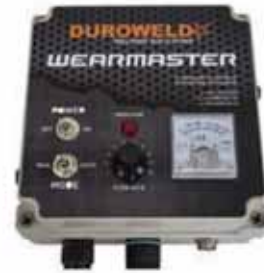
TM-MCB Main Control Box