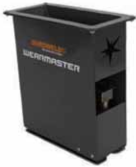
TM-HOPP Hopper / TM-VU Vibratory Feeder Unit