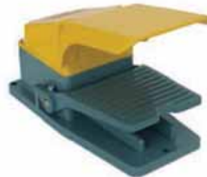
TM-FP Foot Pedal