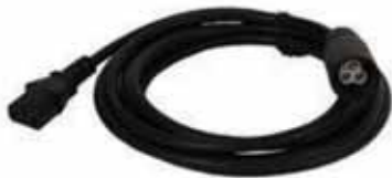
TM-IC Interconnecting Cable