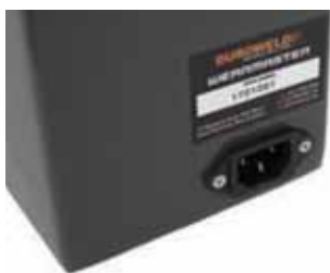
Power Inlet Socket / Serial Number