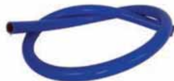
TM-TH Silicon Dropper Hose 16mm