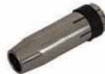
M-145-0080 Dispensing Nozzle